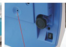
Transport protection device