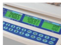
Green LED Backlight